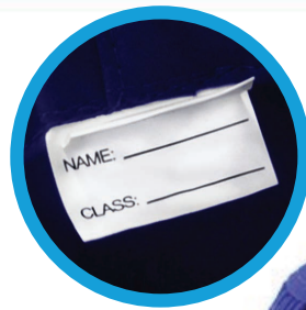
Name tag inside