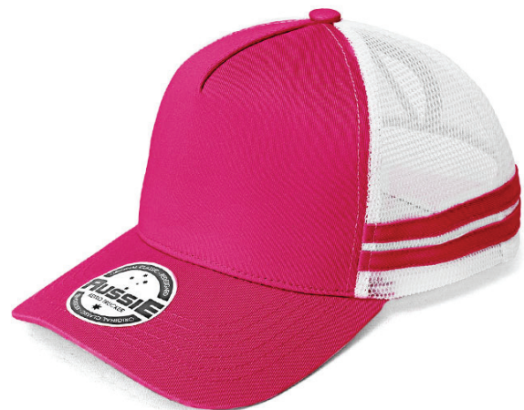
AH457 Hot Pink/White/Hot Pink