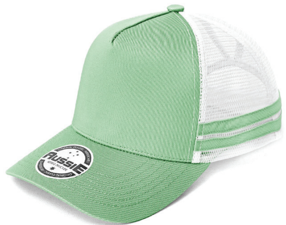
AH457 Mint Green/White/Mint Green