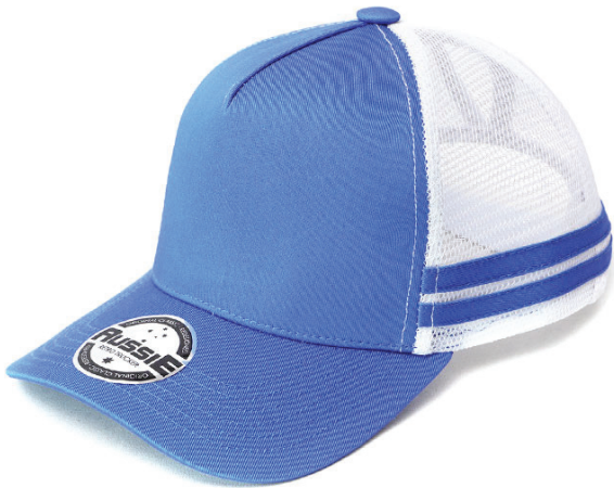
AH457 Ocean Blue/White/Ocean Blue