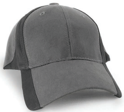
DARK CHARCOAL/DARK GREY