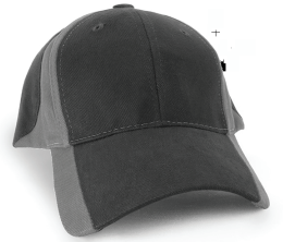
DARK GREY/DARK CHARCOAL