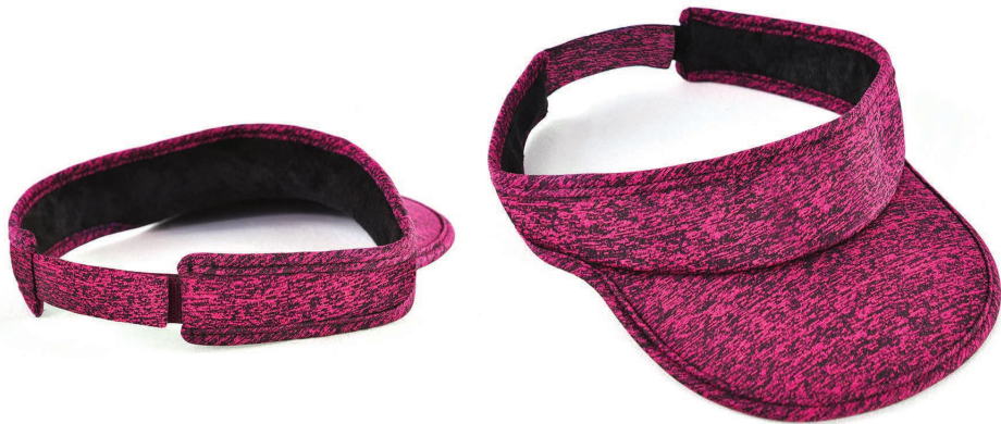
HOT PINK BLACK